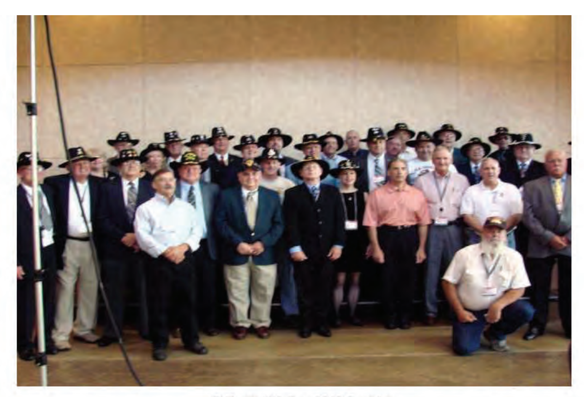
C-Troop 1/9 Cav 2010 Reunion Photo's Courtesy of C-Trp