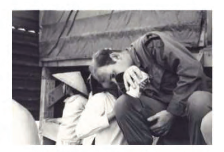
Me, discussing the laundry bill, I'm sure