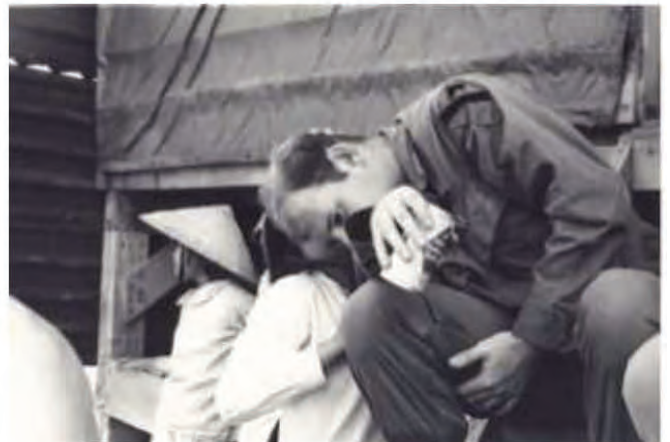
Me, discussing the laundry bill, I’m sure