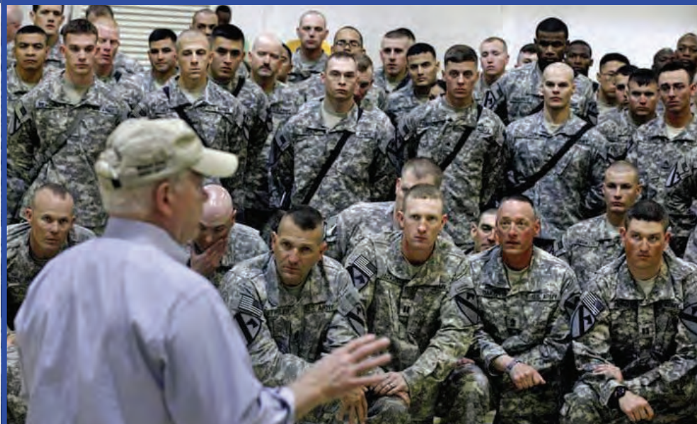
The Secretary of Defense came to visit FOB Marez and 1-9 Cavalry HEADHUNTERS