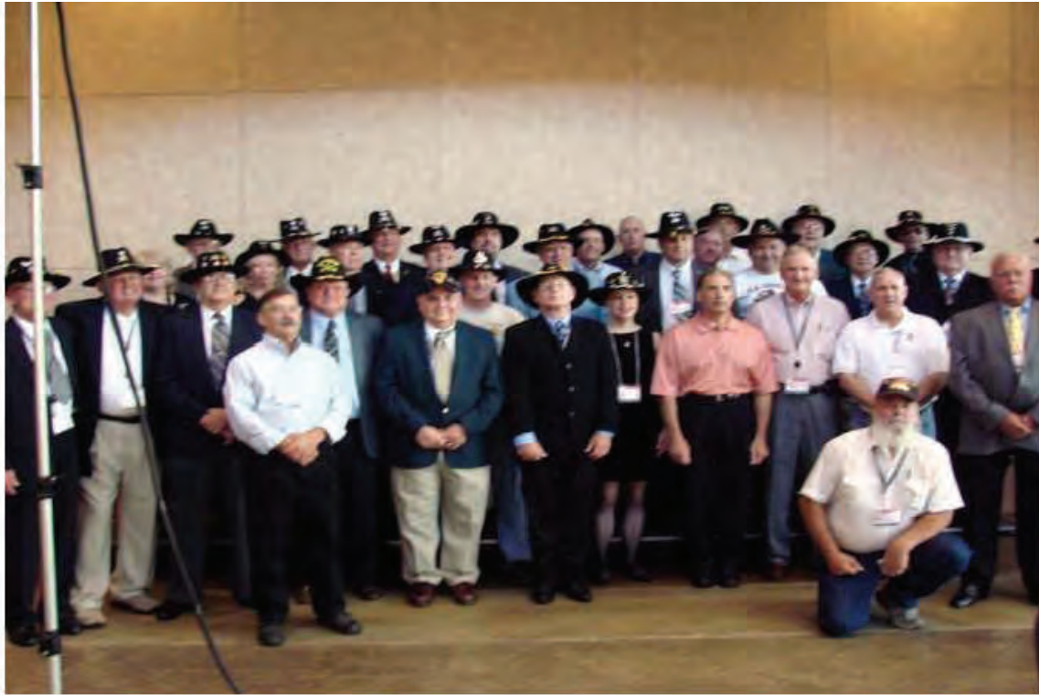
C-Troop 1/9 Cav 2010 Reunion